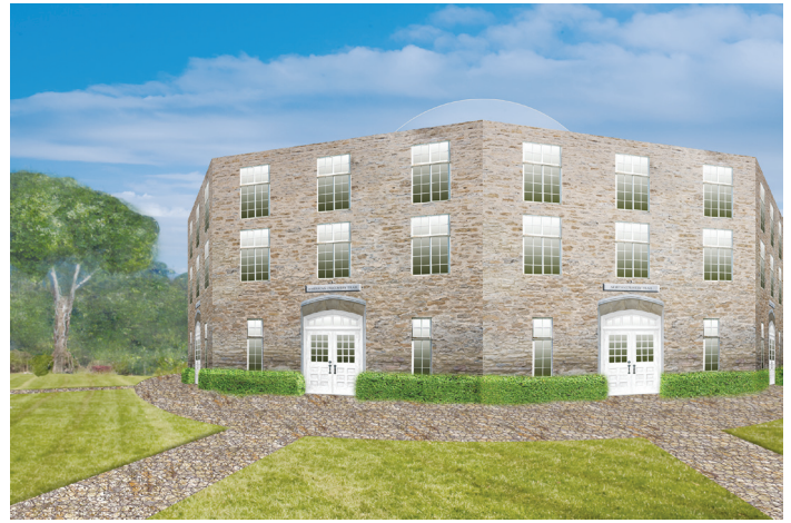
Final conceptual drawing of the octagonal Junction Trails Building. The eight sides of the building celebrate the eight trails meeting in Milford, with each entrance dedicated to an individual trail and its history.

Milford stands alone in this crucial and unique fact: it is the only U.S. community that has eight different national, state, and local trails converging within its city. Milford's exclusive location at the junction of these historic trails has stimulated the interest of both the state and federal government in helping to fund this park.